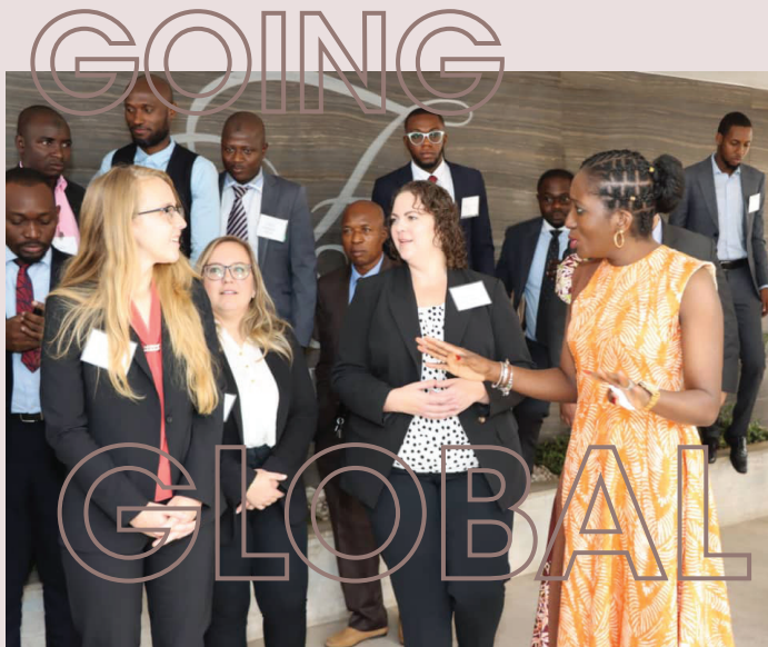
Photo: NCMEC at a training in Nigeria.

Child protection in the United States has become a global challenge that has steadily intensified. In 2022, 90 percent of our CyberTipline reports were linked to other countries.